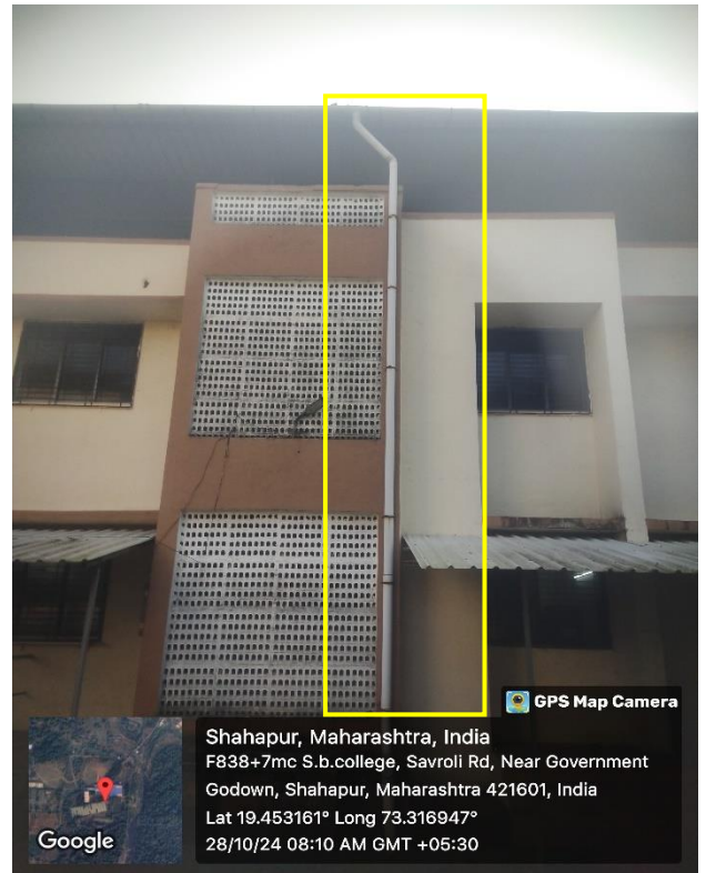
Figure 1 Rain Water Harvesting