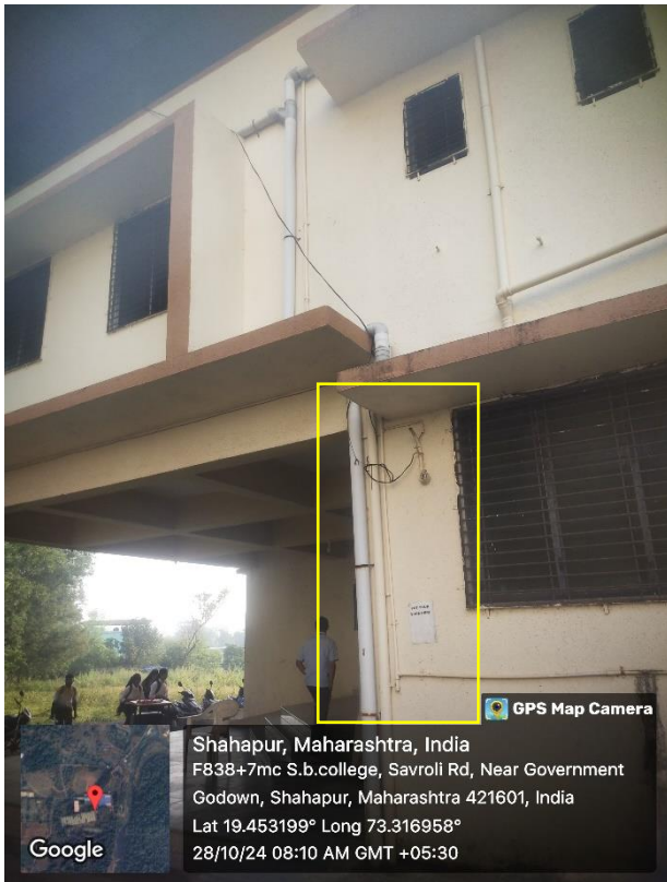
Figure 2 Rain Water Harvesting